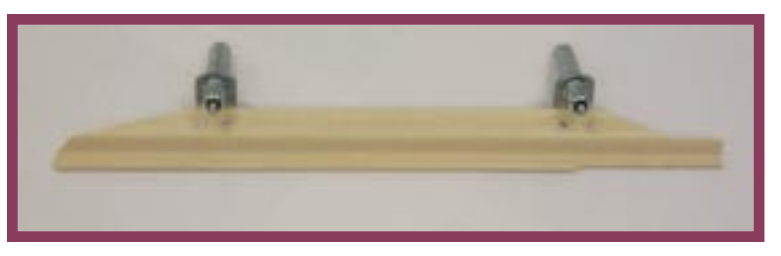
Safety Knife Removal & Installation An added edge shield connects the knife removal tools provides safe and easy knife removal and installation.